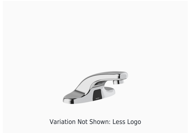
Variation Not Shown: Less Logo